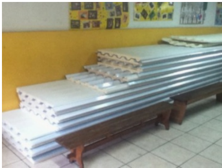
New Roofing Materials

It will have been 4 years since I was last in Brazil with the group from Kirkintilloch Baptist Church and I'm excited to see first hand the developments that have been made since. I also plan to be living in the flats that over this time have been constructed to house visiting volunteers exactly like myself.