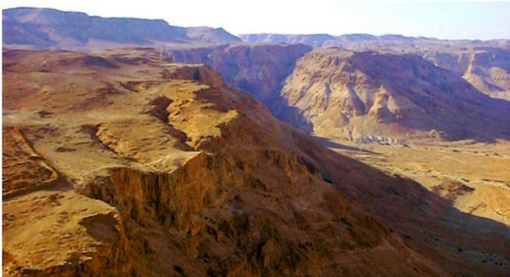
the desert wilderness of Judea

Read the account of Jesus in the wilderness, facing up to the enormous responsibility of what he was about to embark upon, and being so severely tested by the devil. Jesus defeats the power of evil by countering every temptation with a direct quote from Scripture. Matthew Chapter 4, verses 1 – 11.