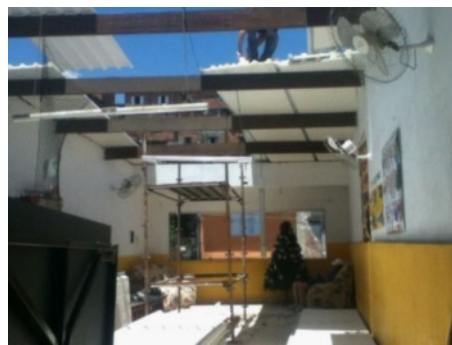
Main roof being replaced