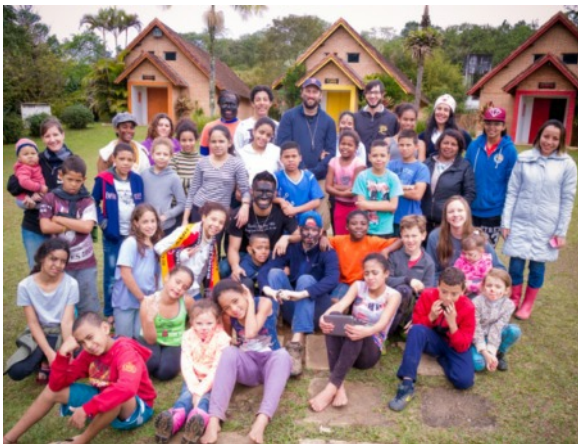
July Weekend Camp (9-11 Yrs)

As you can imagine an event like this takes a lot of planning and effort. But also it takes a lot of support and financial backing. Not only to cover the campsite and the transport, but also the food, resources and equipment involved. Fortunately there always seems to be a very generous sponsor who appears at the 11 th hour and covers some of these costs. If you feel you could help with future camps in some way then let me know, even better go and take part yourself.