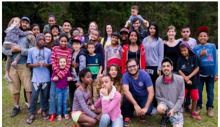
July 4 Day Camp (Teens)

As you can imagine there are many more photos from the activities and fun of the camps and I would encourage you to view them online at www.casasemear.blogspot.co.uk .