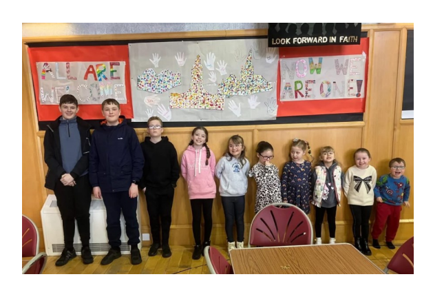
Sunday Live! have been busy!