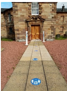
Social distancing discs