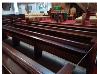
Pews with no cushions, bibles or hymn books