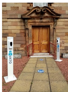
Alcohol gel dispensers